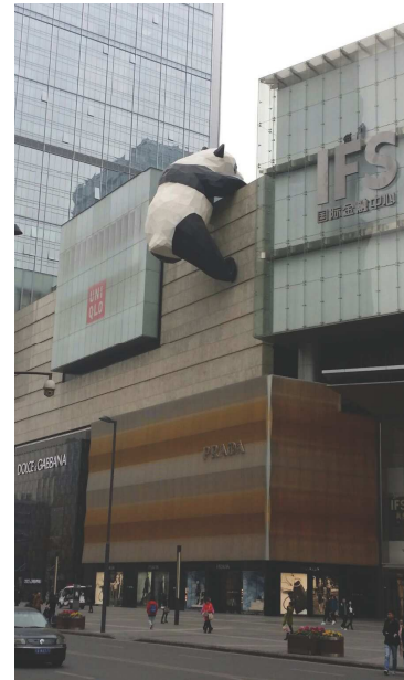
Is it a bear? Is it King Kong? No, wait it's a giant panda crawling up the International Financial Square Mall in Chengdu!

B lack and white are classic staples in fashion and home furnishing. You simply can't go wrong with either of them. And nothing embodies this quite like the panda. A celebrated icon in Chengdu, China, the giant panda has catapulted the city into worldwide recognition. After all, there are only 1,500 giant pandas in the world and 80% of them reside in Chengdu. Let's take a peek at how this gentle creature made its mark in the remarkable capital as well as other inspiring architectures within the city.