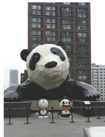
Lo and behold it meets a couple of cute Japanese icons at the top of the building. No wonder the panda looks confused.

Put some black & white in your home! IKEA's Tickar black & white dinnerware