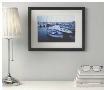
At the very least, having a black and white kitty will add a living touch of class to your home!