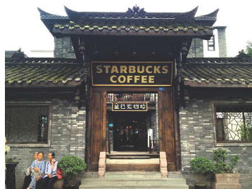
Starbucks at Kuanxiangzi Alley. An American brand takes on an Oriental look.